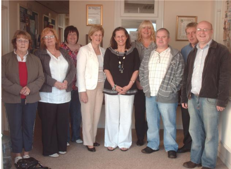
(Above) Community Participants from the Ballymoney Borough who took part in the a2b training 9 September 2009

Hi everyone, and welcome to the October newsletter. September is usually associated with a new term and new opportunities for learning.