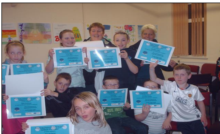
Carnany Youth Club, Ballymoney

The young people received their certificates on the last evening session of each workshop and were congratulated on their excellent work and commitment throughout the programme.